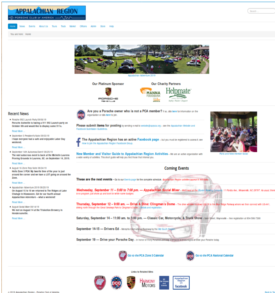
Figure 1. A Website for Busy Viewers.

The two photos are links that take the viewer to descriptions and pictures of recent events. The three logos near the top are links to the club's sponsor and two charities it supports. Four items in bold text provide links to information on how to join the organization, a plea for members to submit articles, instructions on joining its Facebook group, and information on its activities. Below is a list of upcoming events, most with links to more details. On the left sidebar are teasers with links to articles on recent activities. Finally, at the bottom are links to some related sites. There are also some navigation aids (a menu, a search window, and a "You are here" box), but few 30-second viewers will notice these. Finally, although currently, only about five percent of the visits are via cell phones, this will most likely increase, and keeping the home page simply means these users can view it without frustration.